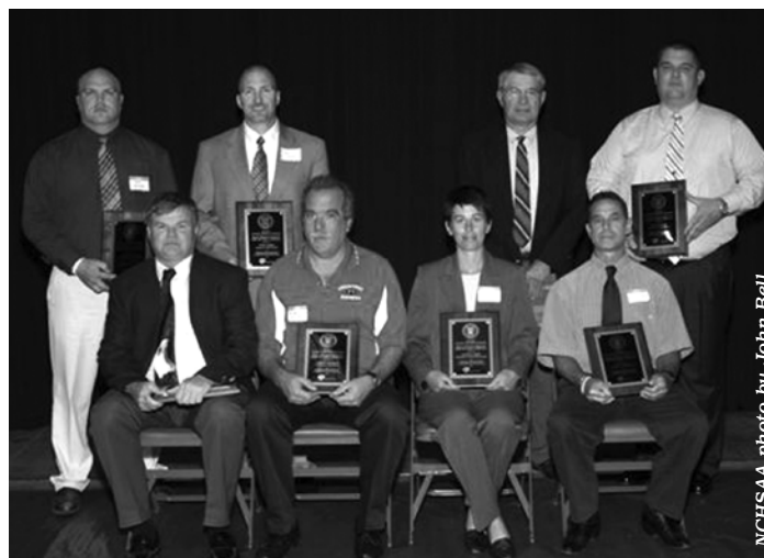
Eight Who Make A Difference Winners for 2008