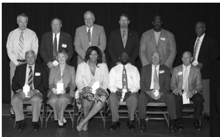
Special Contributors were recognized by the NCHSAA for their efforts