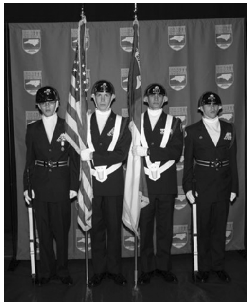
Sanderson's Junior ROTC presented colors