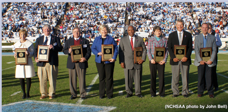
NCHSAA Hall of Fame recipients on field at Kenan Stadium