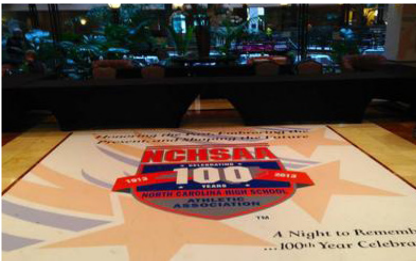
Centennial Logo in Lobby of Embassy Suites