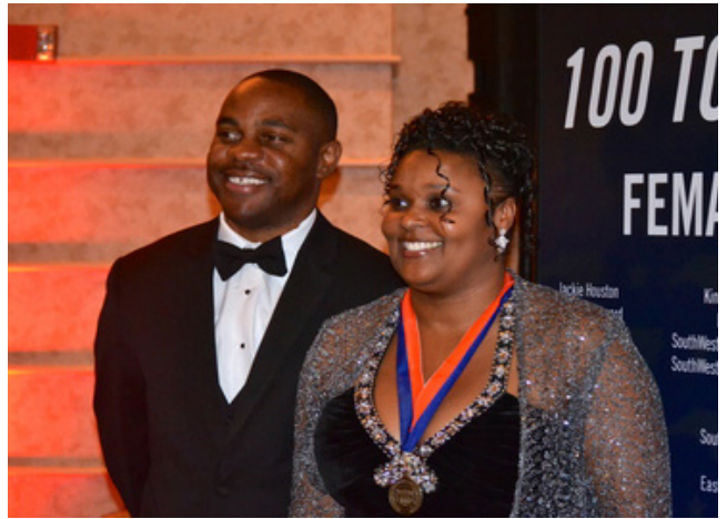
Honorees Were Beaming During Special Night