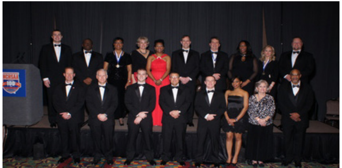
NCHSAA Staff At Event