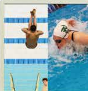
SWIMMING & DIVING