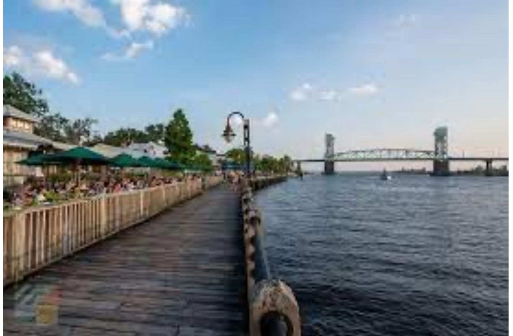
2022 NCADA State Conference April 2nd -5th at the Hotel Ballast in Wilmington