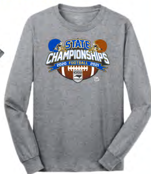
Official Event L/S Tee Shirt with competitors name on back Colors: Grey Sizes: S - 3XL $30