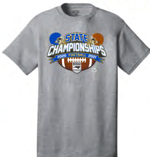
Official Event S/S Tee Shirt with competitors name on back Colors: Grey Sizes: S - 3XL $25