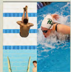
SWIMMING & DIVING