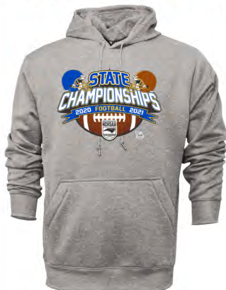
Official Event Hoodie with competitors names on back Color: Grey Sizes: S - 3XL $40

Pre-Order Now! NCHSAA Football Championships Apparel available at GRRTEESMSP.COM